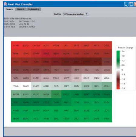
Example of Heat Map Charting

In this example, developers leveraged a heat map charting capability to allow users to gauge portfolio performance quickly over a selected period of time. To make charts easily, developers use the JMSL Library's Chart Programmer's Guide, which contains a chart description, chart example and code example.